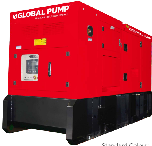
Standard Colors: Red or White

Global Pump generators are specifically designed to provide prime power or temporary power anywhere and anytime utility power is not available.